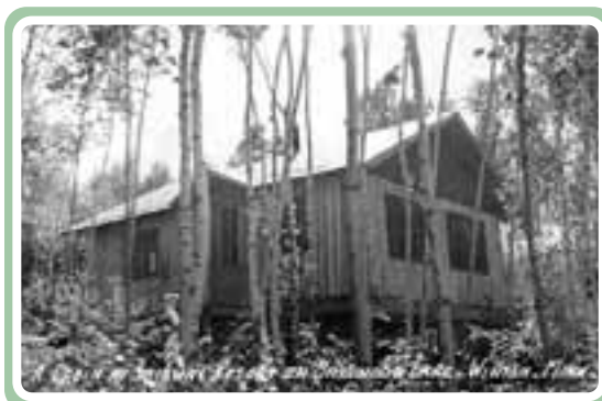
A cabin at Skidway Resort on Basswood Lake, 1940.