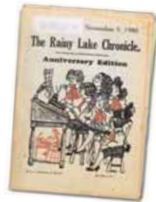
The Rainy Lake Chronicle