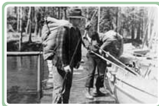
Fishermen getting into a motor launch on Basswood Lake, 1938.