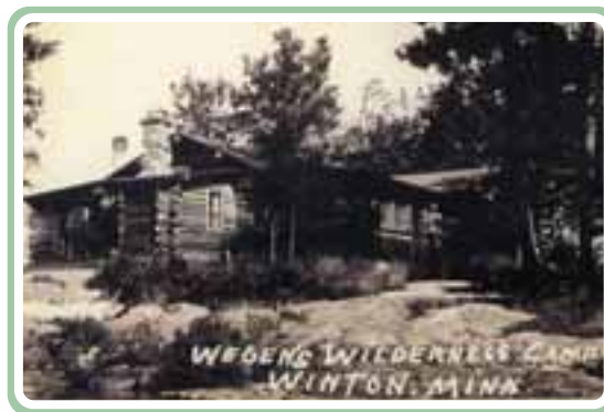
Wegen's Wilderness Camp, 1931.

Other popular destinations on Basswood Lake included the Pipestone Falls Lodge, Skidway Borderline Lodge, Pinecliff Lodge, the Johnson Bros. Fishing Camp, and Evergreen Lodge.