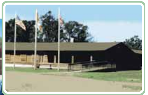
At left: A brochure from the Snowbank Lodge in the 1970s describes moving the main lodge 35 miles from Basswood Lake to Snowbank Lake.