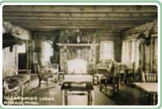
The fireplace at Clearwater Lodge on Clearwater Lake, 1940s.