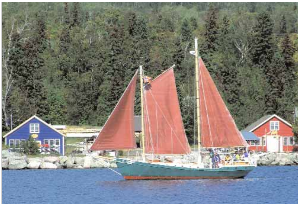
The schooner Hjördis.

Design: Eaton & Associates Design Company Printed on 100% recycled paper with soy-based inks