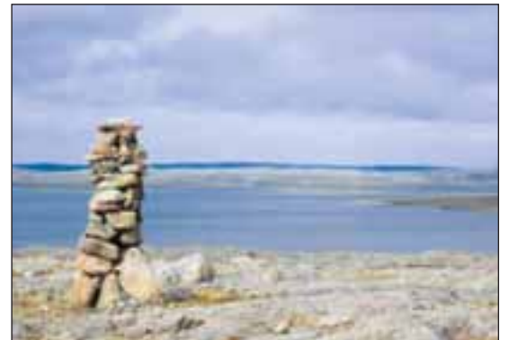
Kazan River inuksuk.