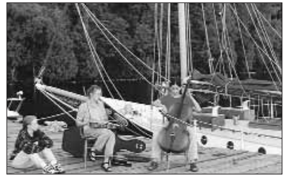
Music on the lake.

The same ethic that builds nesting boxes to know owls better and travels traditionally through nature to better connect with it, makes North House Folk School one with its human and ecological community. □