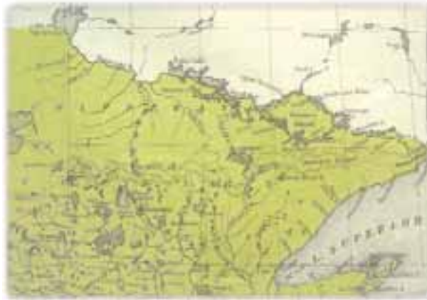
Map of Minnesota Territory, Thomas Cowperthwait & Co., circa 1850.

EFFORTS IN CANADA As the possibility of logging and the threat of overhunting in the Quetico forest loomed, several voices emerged in