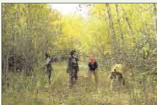
Fall 2006 crew on the Echo Bay Trail.

The Rendezvous will have plenty of opportunities for fun and service. Experienced Park Service personnel will lead two days of trail maintenance, followed by a half day of exploring the