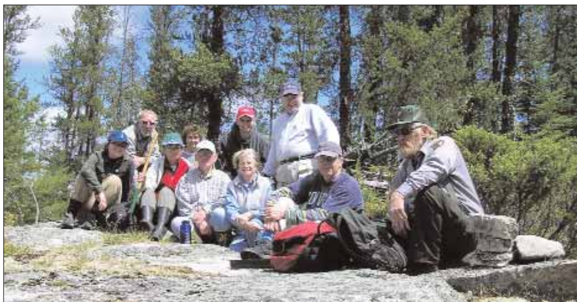
Spring 2006 crew on the Kab-Ash Trail.

With continued support from the Quetico Superior Foundation, the bridge-building between park users and local communities will continue. This year's Volunteer Trail Rendezvous will be arranged by a Trails Partnership of citizen groups and local business owners working with the park. Voyageurs National Park Association, Friends of Voyageurs National Park, and the Kabetogama Tourism Bureau are all Trail Partners for 2007.