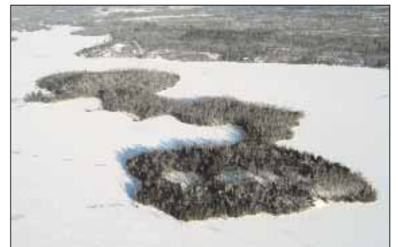
Wolf Island.

The projects are currently in the Ontario Ministry of the Environment's Environmental Screening Process. You may address concerns and comments to the Honourable David Ramsay, Minister of Natural Resources, Room 5540 Whitney Block, 9 Wellesley Street West, Toronto, ON M7A 1W3.