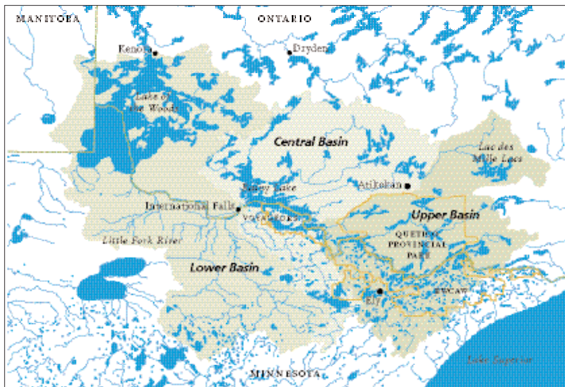
Lake of the Woods Watershed. Map illustration by Patrick Jannette.

The headwaters of the basin include extensive areas of Canadian Shield topography in wild areas including the Boundary Waters Canoe