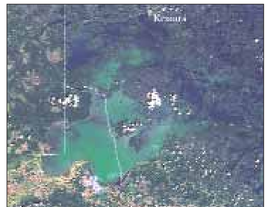
Satellite Map showing extensive algal blooms on the north basin of Lake of the Woods and Shoal Lake, Aug. 7, 2006.

Sometimes, however, the various factors – natural and human-caused – that affect water quality are more difficult to untangle. The vast, varied, and downstream Lake of the Woods, which may make the impaired list in 2008, is one such case. Algal blooms, some of which include toxic blue-green algae, or cyanobacteria, appear to have increased in recent years there. But just how much of the apparent increase is due to increased shoreline development and other human factors, and how much is part of the natural regime is still a question in search of answers.