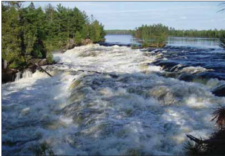
High Falls on the Namakan River.

As environmental assessment continues on two dams proposed for the Namakan River west of Quetico Provincial Park, an area conservation group is now publicly opposing the project. The Rainy Lake Conservancy, which had previously taken a neutral position regarding Ojibway Power and Energy Group's plans to build dams at Hay Rapids and High Falls, is now against construction.