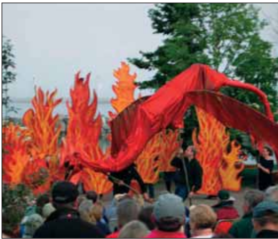
The Ham Lake Fire as performed in the North House Folk School Summer Solstice Pageant, June 23, 2007.