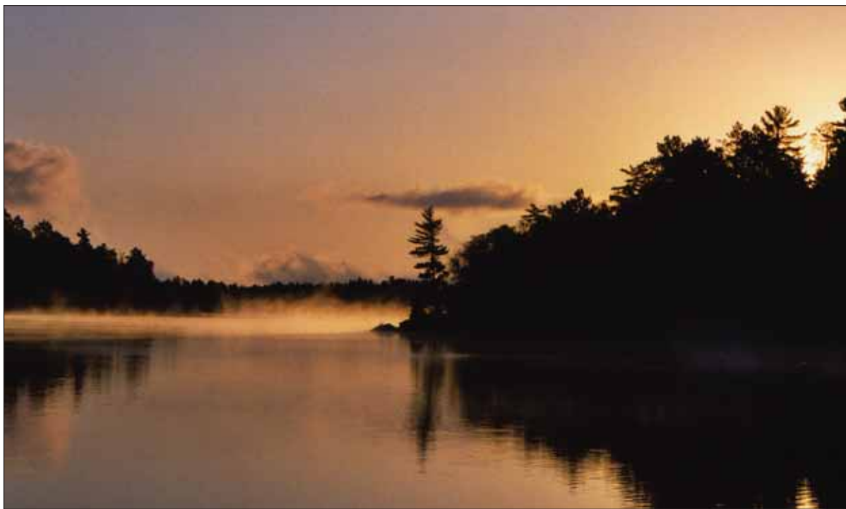
Summer sunrise: Voyageurs National Park.

Printed on 100% recycled paper with soy-based inks