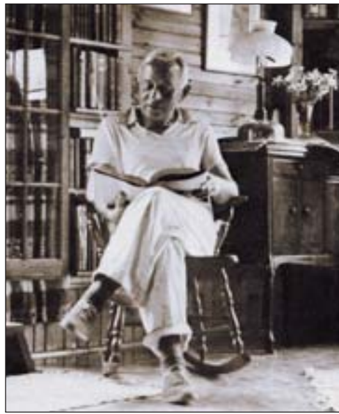
Ernest Oberholtzer. Photographer unknown, circa 1940's.

Today, the Ernest C. Oberholtzer Foundation "maintains Ober's island home as a place of inspiration, renewal and connection to the natural world."