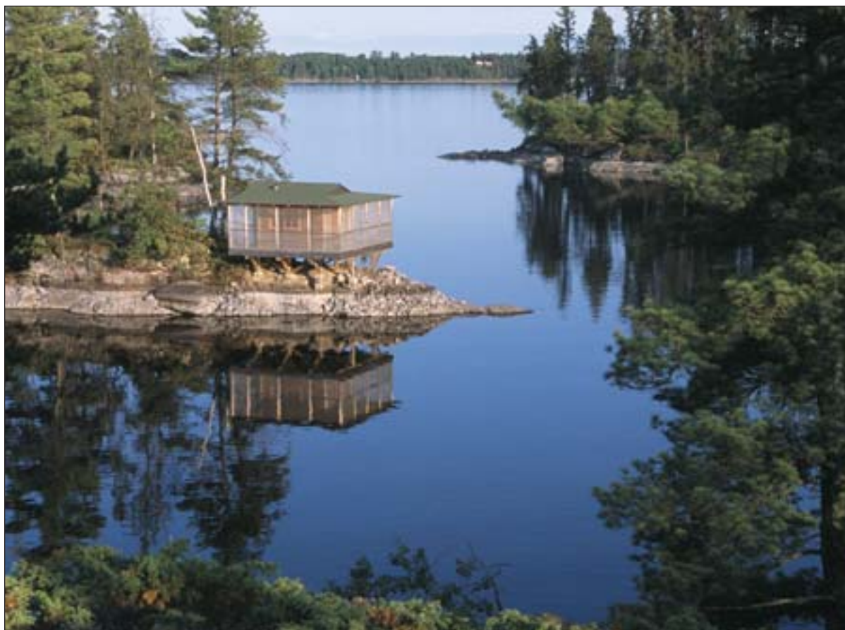
The Japanese House on Mallard Island, as seen from Crow Island.