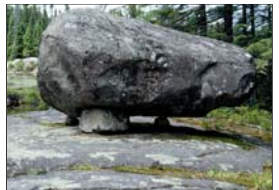
Dolmen stones near Lake Lujenida.