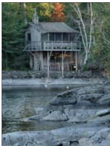
Cook's House.