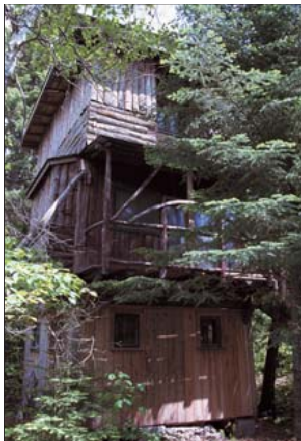
The Bird House.